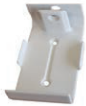
optional wall mounting bracket